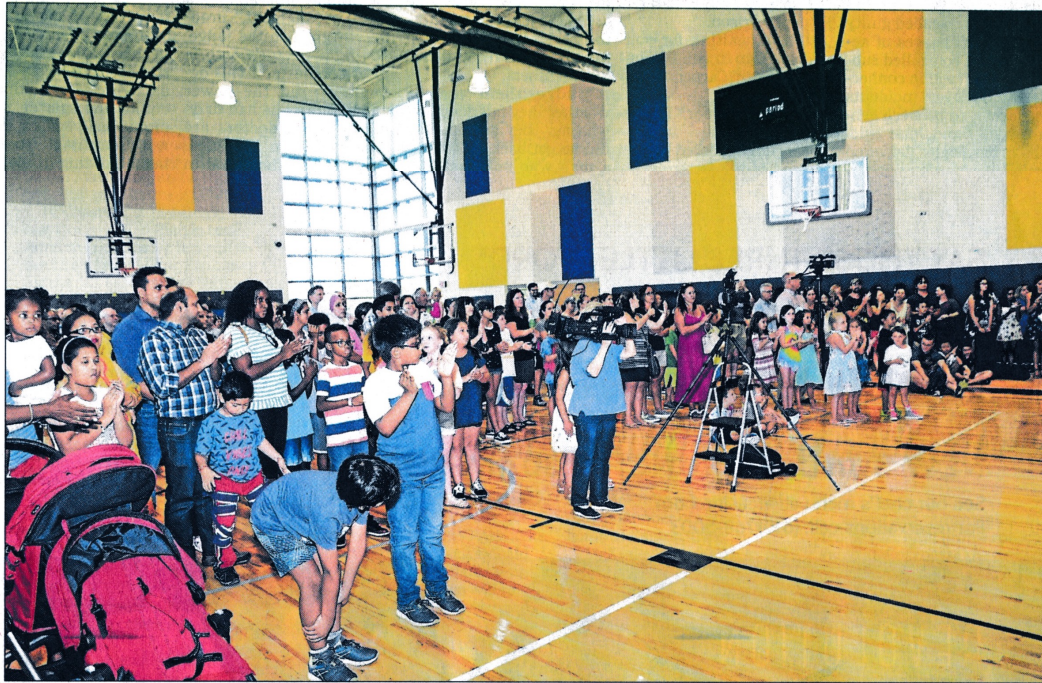
Families and students gather in the gym for the official opening of the new Caley school.