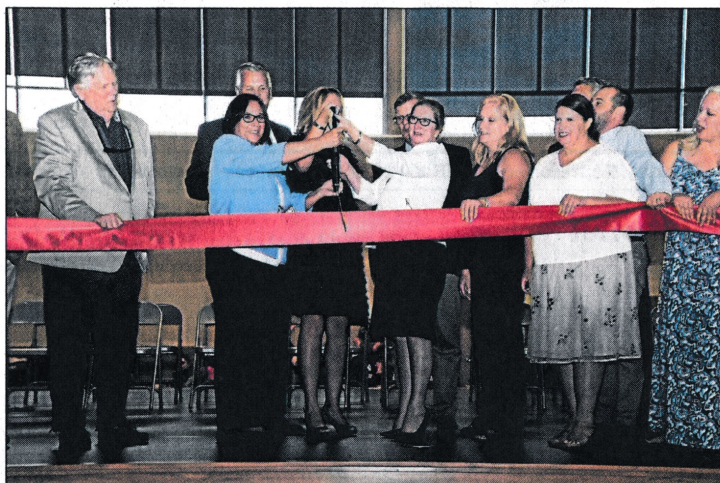
The official ribbon cutting for the new Gulph school.