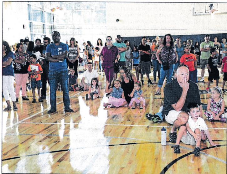
Family and friends gather in the gym of the new Gulph school.