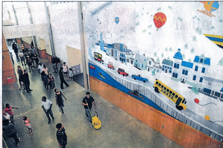
The mural in the new Caley school

"It's not about speeches tonight. We're not here to hear people speak, that's not the focus," he allowed. "We're here to let people roam through the building. Go explore. We want people to