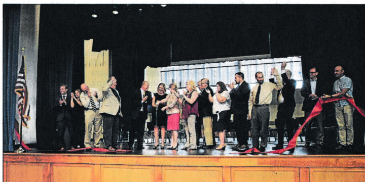
The “official” ribbon cutting for the new Caley school