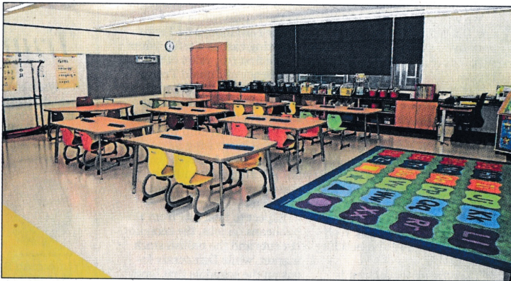
One of the classrooms in the new Gulph school.