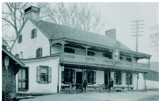
The King of Prussia Inn: Once the center of our community, the (c. 1756) King of Prussia Inn's iconic presence still stands as a proud reminder of our past.

Members will have an opportunity to meet like-minded neighbors, community leaders, and historians who share an interest in expanding the knowledge of the fascinating history of Upper Merion Township and its architecture, genealogy, and other remarkable intriguing aspects.