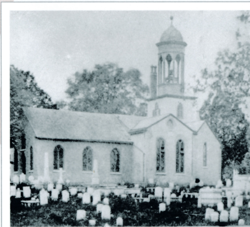
Christ Church-Old Swedes: The congregation was established early in the 17th century.

The Society publishes a quarterly publication to share and to encourage scholarship and to promote interest in local historical topics. The King Of Prussia Gazette is provided to Society members as a benefit of membership. Back issues are available on the society website.