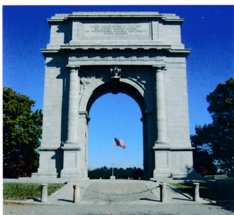
Valley Forge National Memorial Arch: Built in 1910 by authorization of the secretary of war and given to the Commonwealth of PA on June 19, 1917 to commemorate the 139th anniversary of the evacuation of Valley Forge.

We are always looking for new people to step up and take on new projects. If interested, please come to a meeting and talk to us, or contact us by electronic or conventional mail.